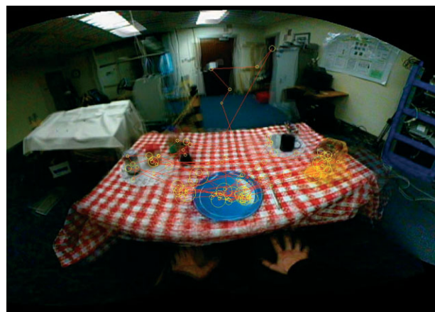
FIGURE 1 | The yellow circles show the fixations made while a subject makes a peanut butter and jelly sandwich. Views from a video camera mounted on the subject's head have been superimposed to make a composite mosaic to compensate for the subject's head movements during the task using the method described by Rothkopf & Pelz (2004). The diameter of the yellow circles indicates the duration of the fixations.

Thus, the basic structure of the task allows one to link the visual operations fairly closely in time with the occurrence of eye and hand movements. Not only is the sequence of fixations tightly linked to the task, but also many of the fixations appear to have the purpose of obtaining quite specific information. For example, subjects fixate the middle of the jar for grasping with the hand in a vertical posture and the rim for putting on the lid, with the hand in a horizontal posture. This suggests that the visual information being extracted